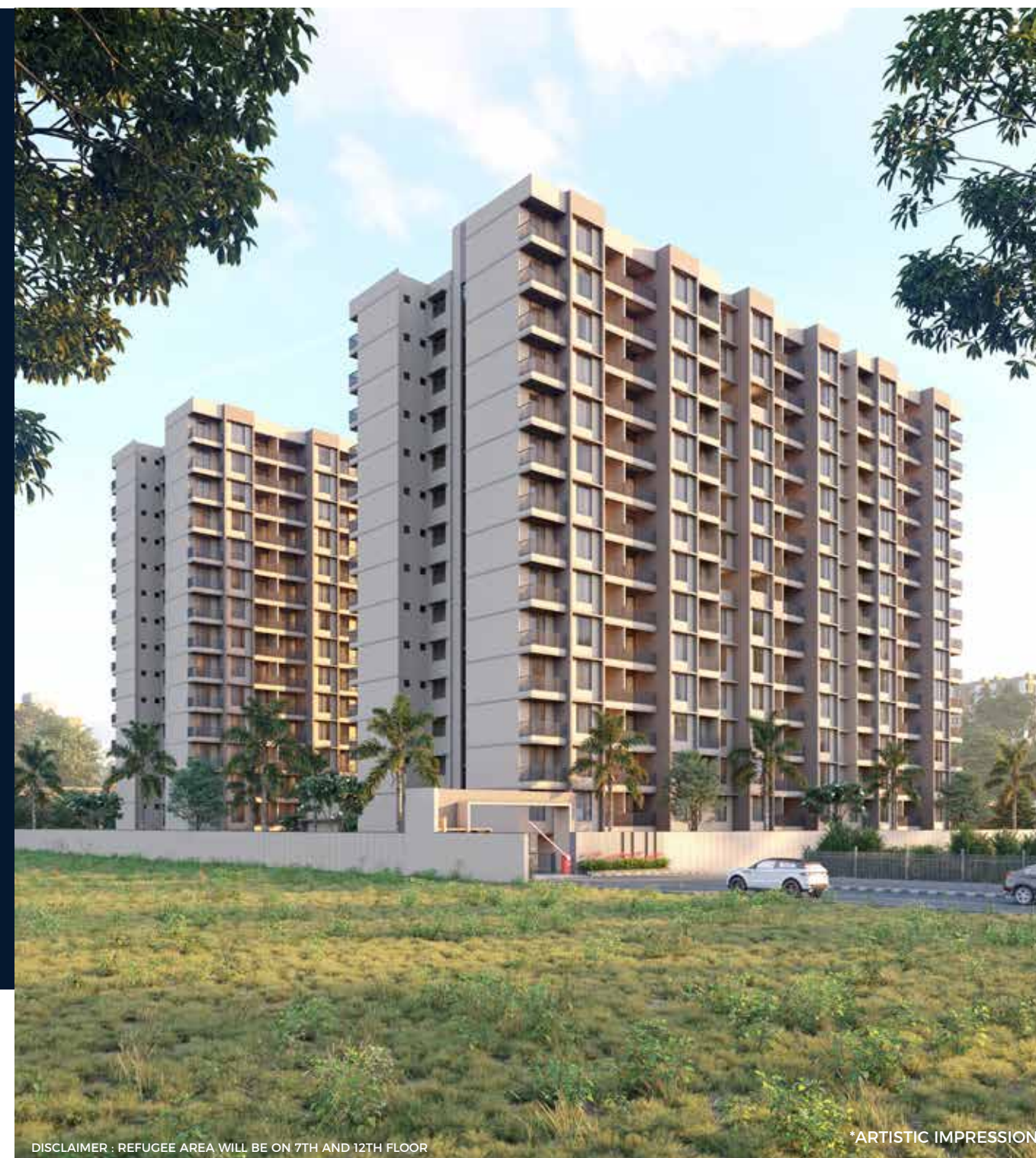
DISCLAIMER : REFUGEE AREA WILL BE ON 7TH AND 12TH FLOOR ARTISTIC IMPRESSION